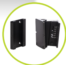
Compatible with RF UB universal mounting bracket