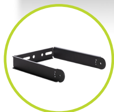
U bracket included